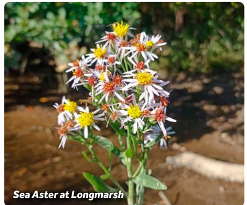
Sea Aster at Longmarsh