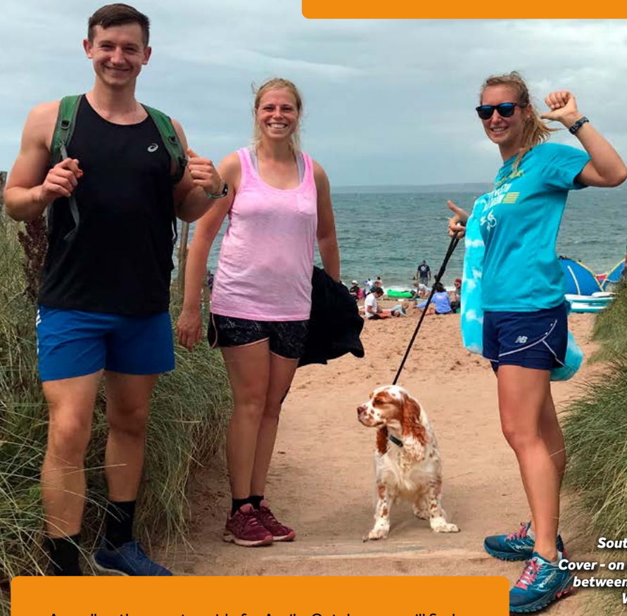
South Milton Sands Cover - on the Coast Path between Wembury and Wembury Point

Welcome to our 2024 Explorer packed full of ideas to get out and enjoy the South Devon National Landscape.