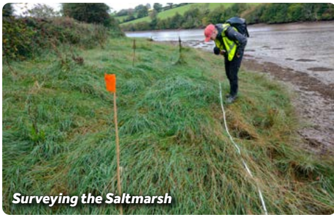
Surveying the Saltmarsh

Saltmarshes are very well recognised for several important and significant ecosystem services – effectively what saltmarshes do for us and our wider environment. This is everything from capturing and storing more carbon than tropical rainforests, to buffering waves, sheltering nursery habitats for fish and many special invertebrates.