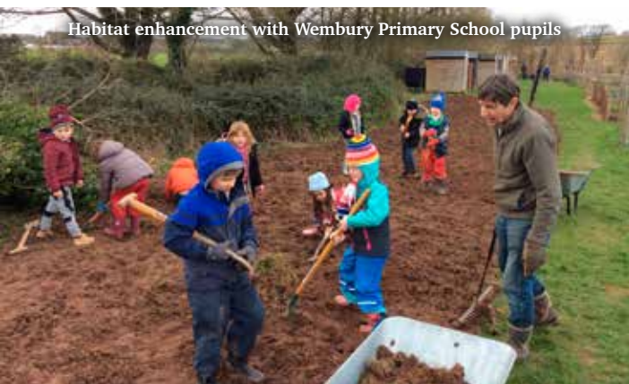
Habitat enhancement with Wembury Primary School pupils

We have completed a draft set of project plans which will be developed with the parish council and local communities and delivered, subject to funding being secured, from 2020. The project will be developed. Some community projects have been completed including habitat enhancements at Wembury primary school playing fields and wildlife meadow and habitat improvements at Wembury allotments.