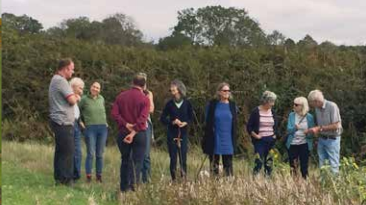
Pollinator farm walk