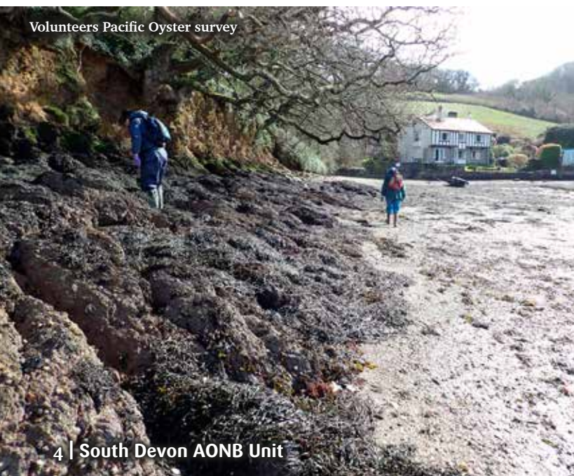
Volunteers Pacific Oyster survey

The partnership website ( south-devon.org ) has news, resources, and information to supplement regular emails, newsletters and telecoms.