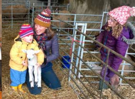
Left to right: Kingsbridge Strollers; Mobile Planetarium; Lambing and Kidding Live at Daynes Farm