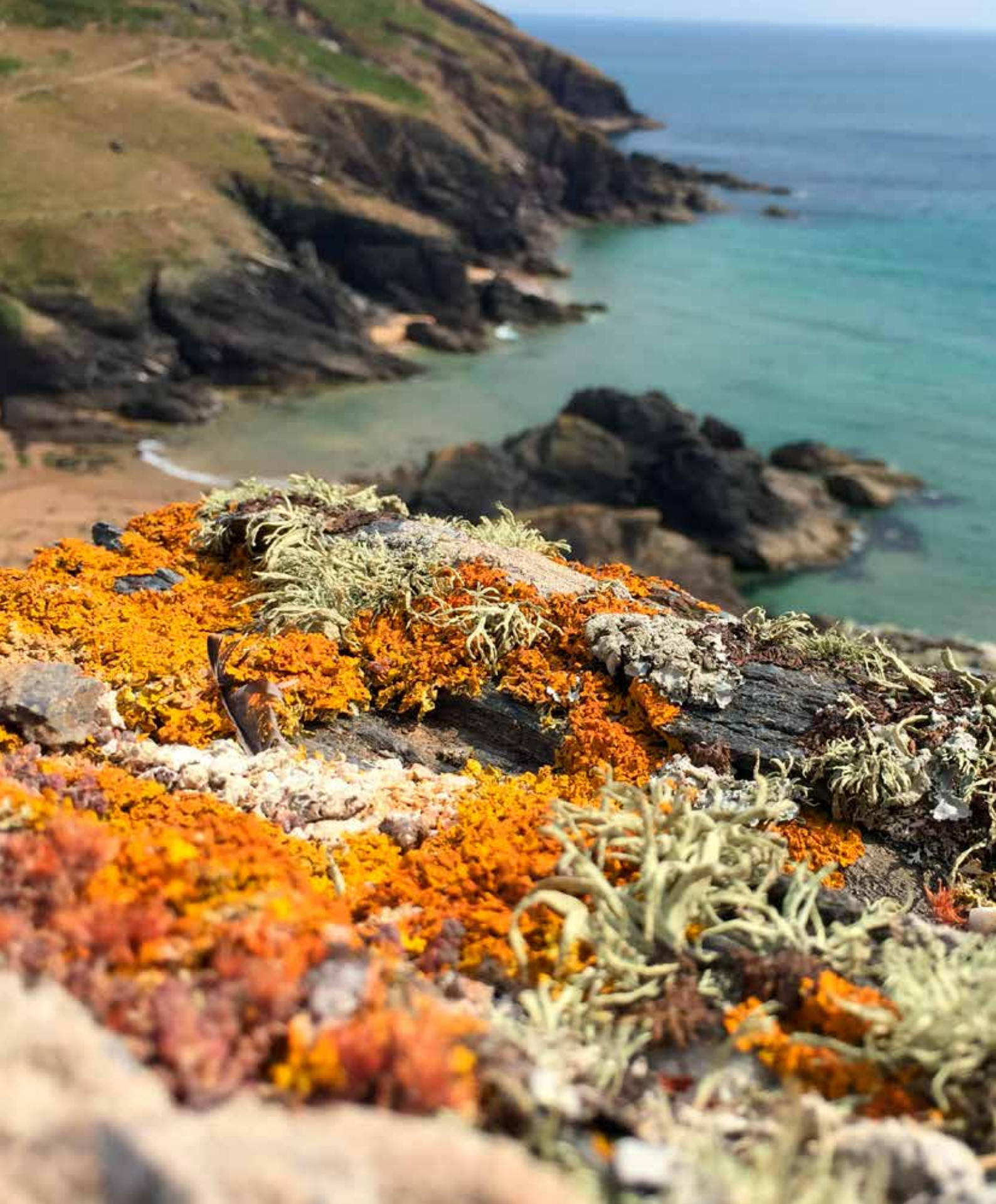
Photo credits: Back cover: Looking from Soar © Georgie Lethbridge. Pg 5 top R: © Jim Brown All others AONB Photo Competition entries, contributed or © South Devon AONB Unit. Design by South Hams District Council.