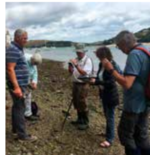
Briefing volunteers, Pacific Oyster survey

The Erme, Avon and upper Dart Estuary have all been confirmed as new 'Marine Conservation Zones' meaning that all of the estuaries within the South Devon AONB and much of our coast, are at least in part designated as Marine Protected Areas. Areas to be understood, used and enjoyed responsibly and sustainably.