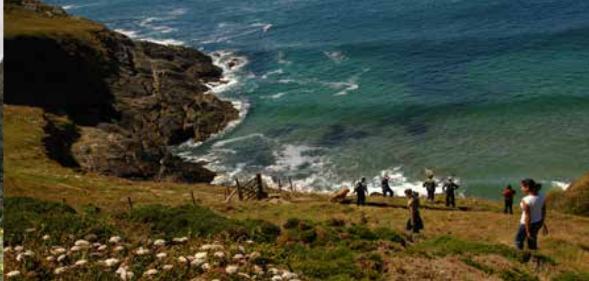
Prawle Point walk