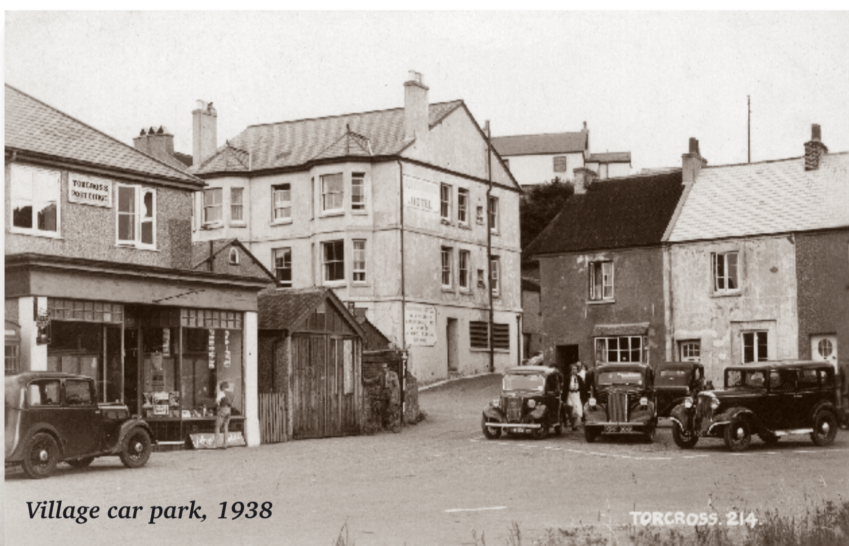
Village car park, 1938