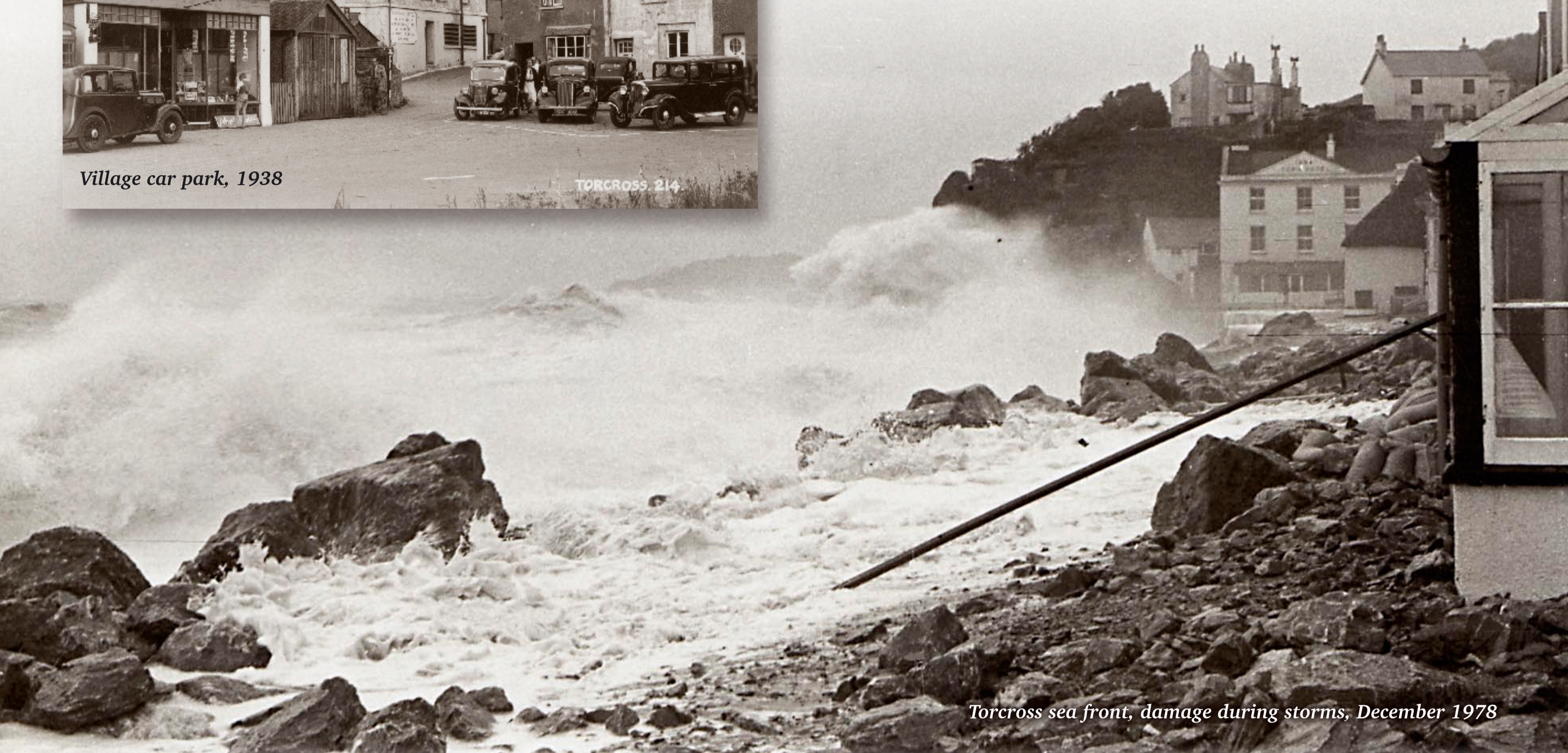
Torcross sea front, damage during storms, December 1978