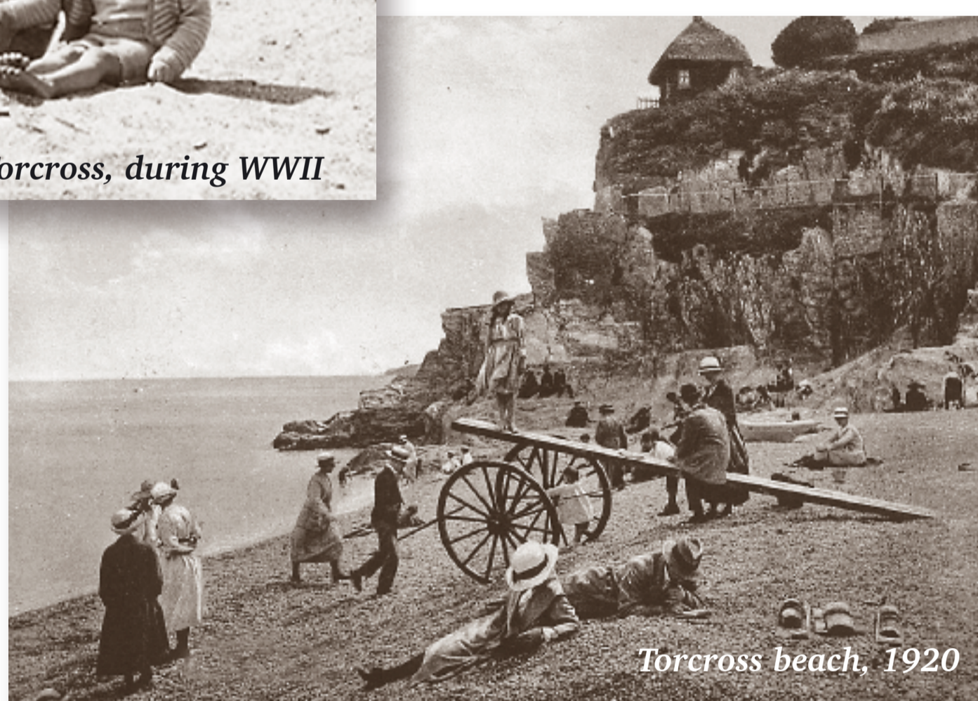
Torcross beach, 1920

In 400 years Torcross has seen many changes, some caused by world events, some by the sea which it lives alongside.