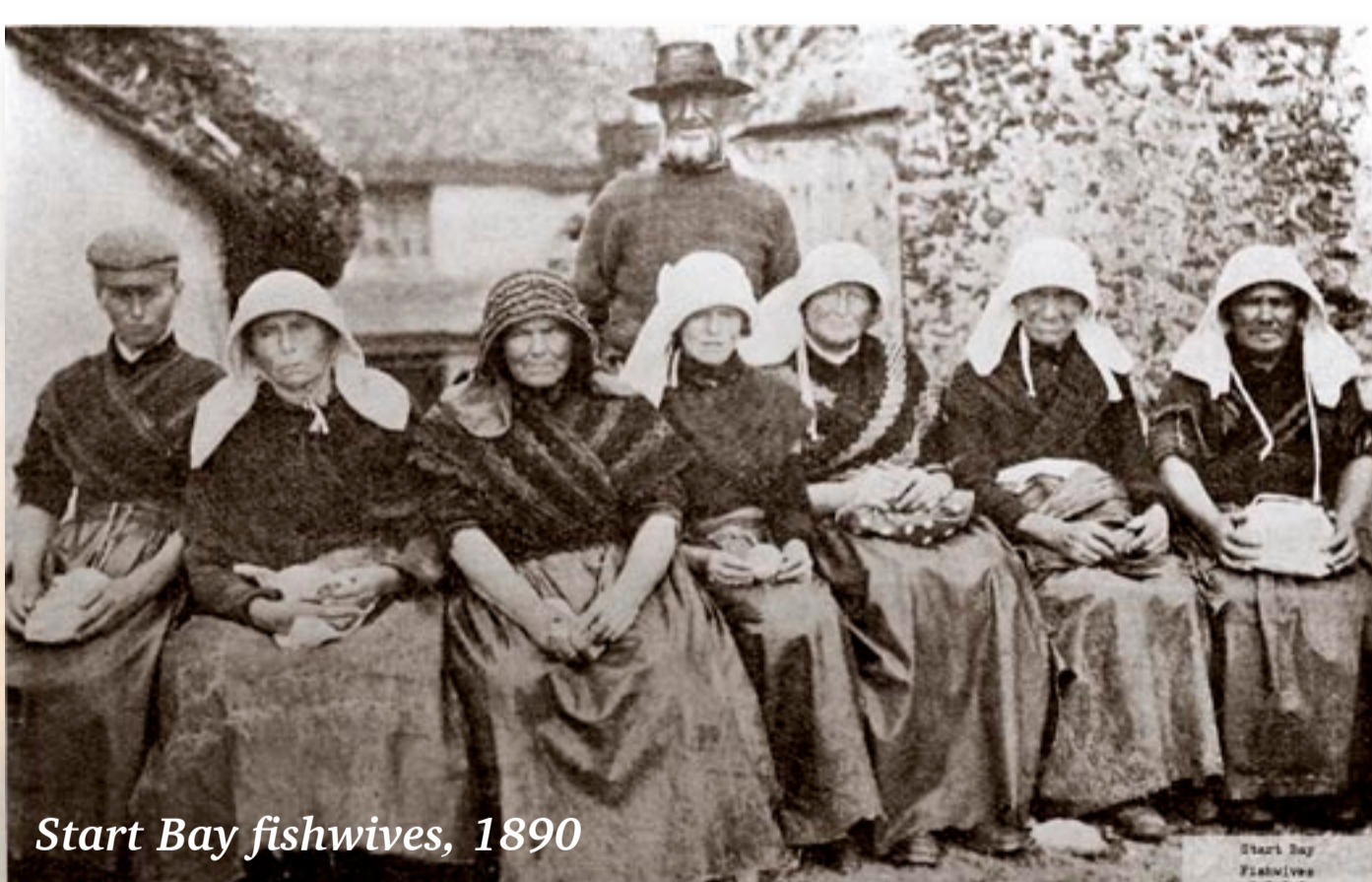
Start Bay fishwives, 1890