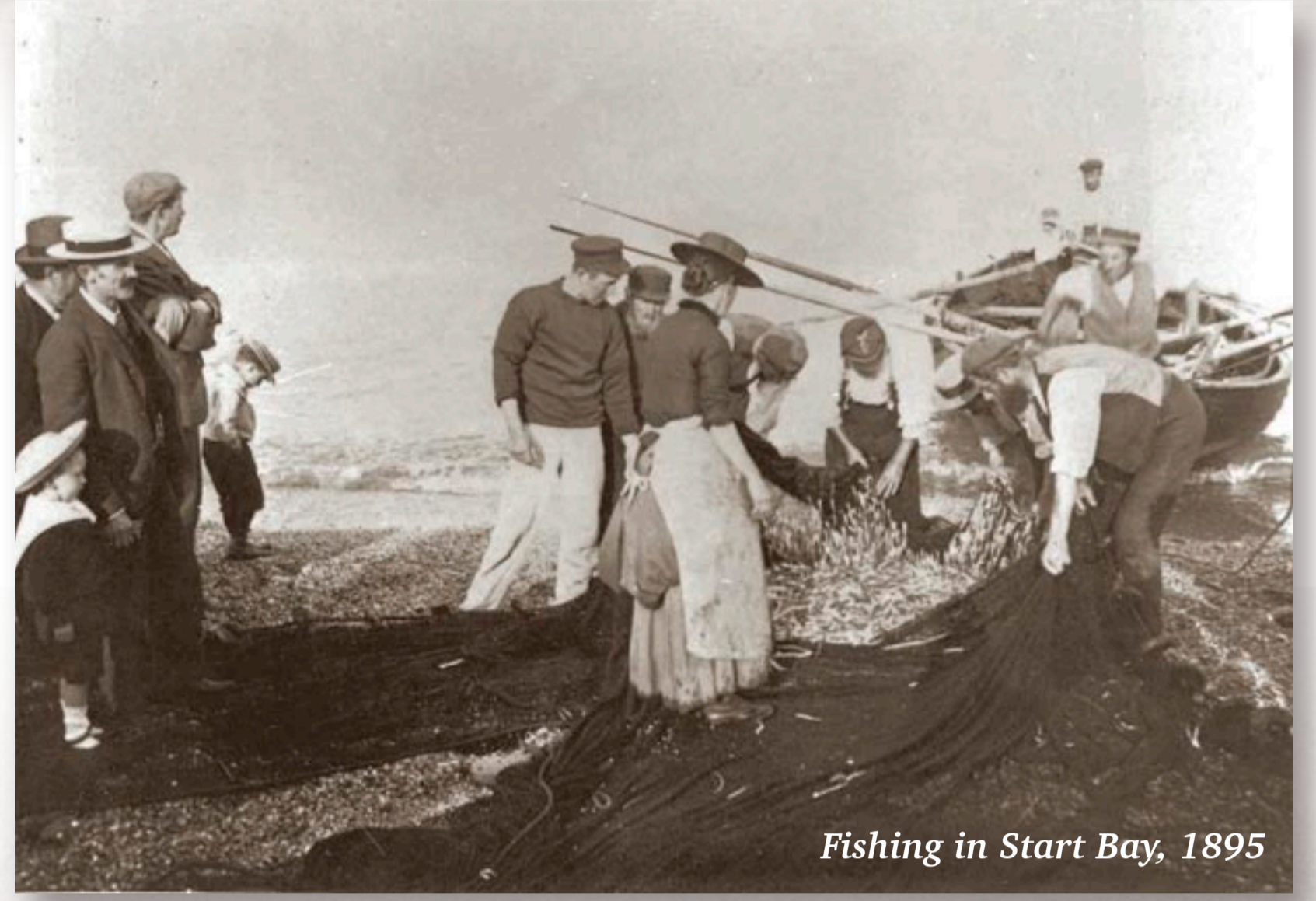
Fishing in Start Bay, 1895

In Elizabethan times, England began to build a navy, scaring off the sea-raiders and making it safe, for fishing families to live close to their work. The village of Torcross was first recorded in 1602, when it took its place together with the other settlements in the Stokenham manorial court.