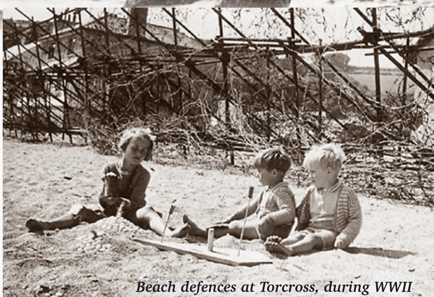
Beach defences at Torcross, during WWII

In 400 years Torcross has seen many changes, some caused by world events, some by the sea which it lives alongside.